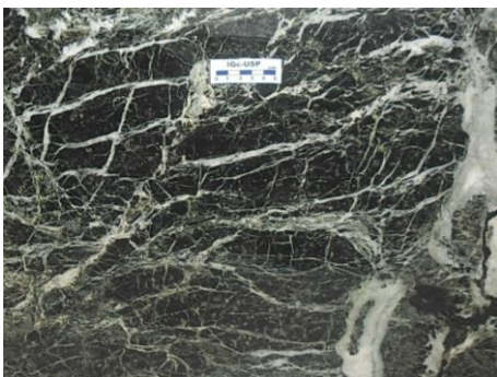
Serpentine from Italy