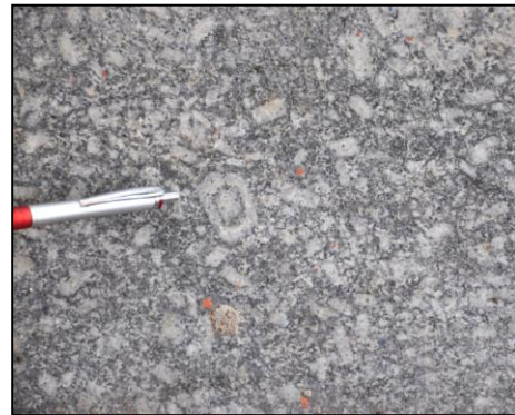
Grey Mauá Granite Sculptor Victor Brecheret's favorite