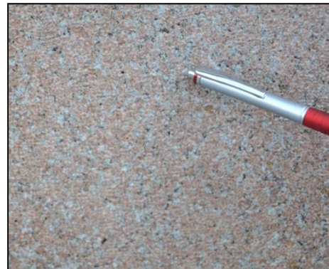
Pink Itupeva Granite Example of reddish granite