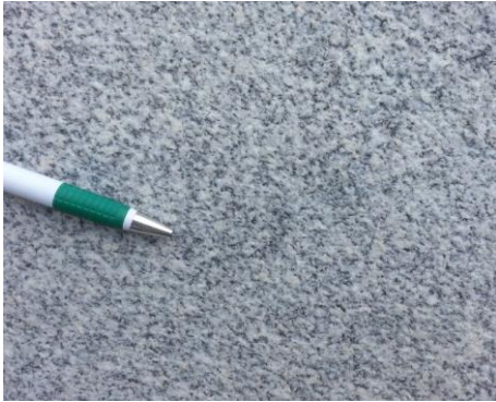
Itaquera Granite The granite that built São Paulo