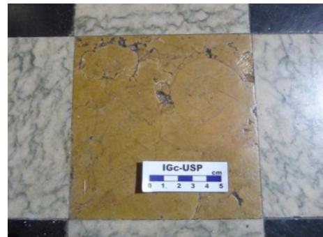
Giallo Verona from Italy