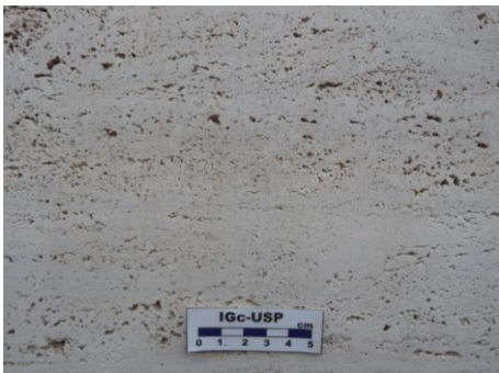
Travertine from Italy