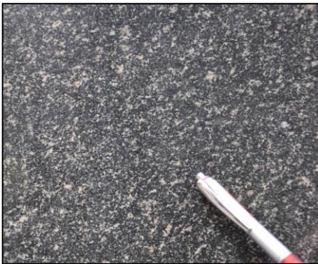
Black Piracaia Granite The granite that is not a granite