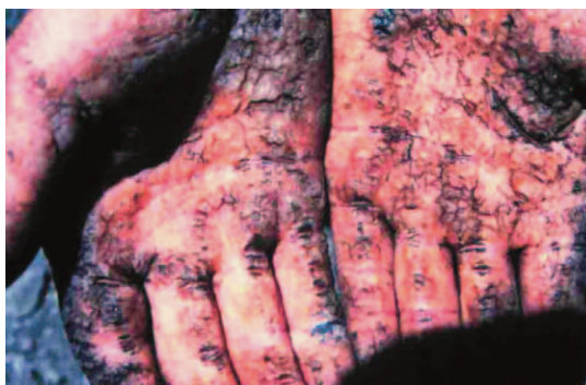
Figure 1 – Hyperkeratosis caused by exposure to arsenic mobilized by burning arsenic-rich coal in a residential environment in China.

We believe that the internet has played a major role in the resurgence of Medical Geology. The internet has provided the ability to instantly disseminate information throughout the world. Graphic color images, announcement of upcoming conferences and new books, publication of research reports, etc. are now within reach for every person concerned with these issues even in the most remote parts of the planet. These are commonly the places where these environmental health problems are most evident and most severe. An indication of the power of the internet and the rapid growth of Medical Geology can be gleaned from the number of Medical Geology ‘hits.’ As of January 1, 2006 ‘Medical Geology’ produced more than 20,000 hits on the Google search engine and almost 12,000 hits on Yahoo, where just a few years ago the hits were measured in the hundreds.