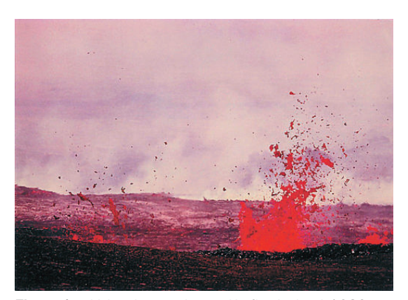
Figure 1 – Volcanic eruption at Krafla, Iceland 1980.

Volcanism and related activities are the principal processes which bring metals to the surface from deep in the earth. As an example, the volcano Pinatubo ejected about 10 billion tonnes of magma and 20 million tonnes of SO<sub>2</sub> over just two days in June 1991 and the resulting aerosols influenced the global climate for three years. This event alone introduced two million tonnes of zinc, one million tonnes of copper and 5,500 tonnes of cadmium to the surface environment. In addition to this, 100,000 tonnes of lead, 30,000 tons of nickel, 550,000 tonnes of chromium and 800 tonnes of mercury. Volcanic eruptions redistribute those elements which under certain conditions are regarded as harmful, such as arsenic, beryllium, cadmium, mercury, lead, radon and uranium, plus the remaining 72 elements, many