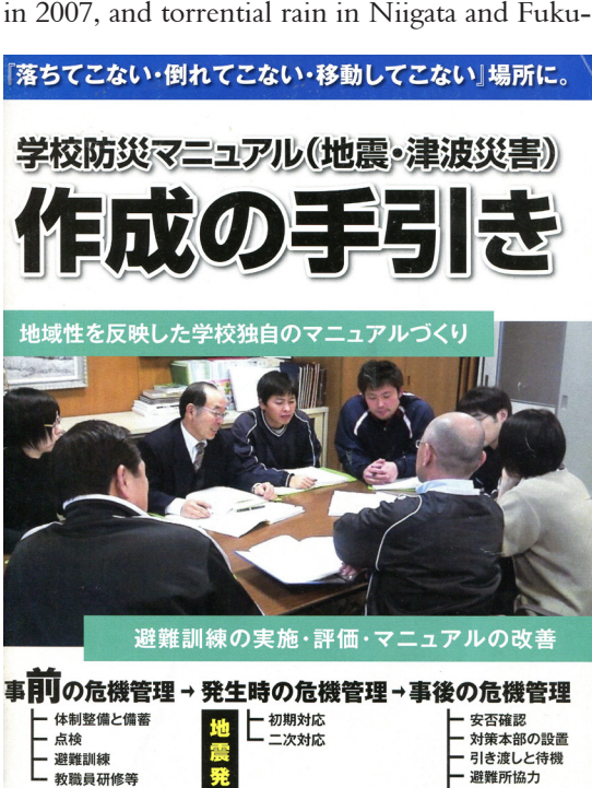
🚵 文部科学省 Figure 2. "A Guide to Compiling School Disaster Prevention Manuals (Earthquakes/Tsunami)"

Subsequently, each administrative division of Japan received support through MEXTs "Practical Disaster Prevention Education Support Project", conducted numerous teacher training courses, and addressed issues in supplementary readers on disaster education. However, the issue of school safety had been raised before the 2011 GEJET. The School Health and Safety Act had been in force since April of 2009, and there had been demand for the enhancement of school safety through the formulation of a comprehensive school safety plan. The factors behind this demand included the school invasion and massacre at Ikeda Elementary School (an elementary school affiliated with Osaka Kyoiku University), accidents in which students fell from school buildings, and traffic accidents outside schools. These incidents led to calls for an urgent response regarding daily safety (including crime prevention), road safety, and disaster safety (synonymous with disaster prevention). During the disasters mentioned above (the Great Hanshin-Awaji Earthquake of 1995, the subsequent Chuetsu Earthquake in 2004, the Chuetsu-oki Earthquake in 2007, and torrential rain in Niigata and Fuku-