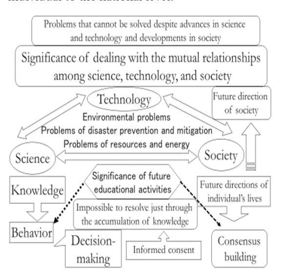
Figure 5. The mutual relationships among science, technology, and society

Regardless of the extent of knowledge that an individual accumulates, he or she cannot state for sure that knowledge alone will solve a problem, and often it does not. This leaves us with the increasingly perplexing question of what type of decision-making we should adopt, at all levels, from the individual to the national level.