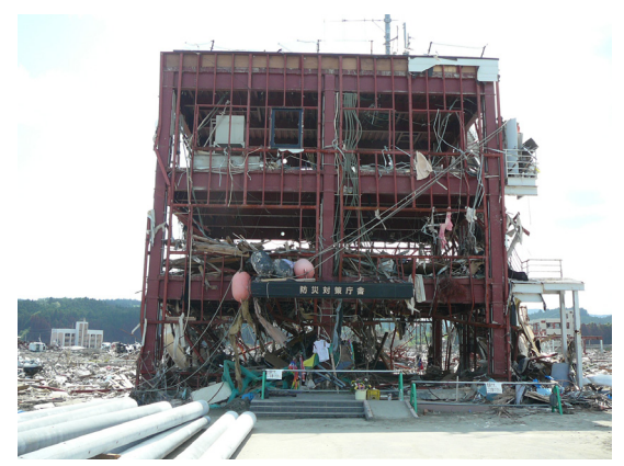
Figure 3. Damaged Buildind by the 2011GEJET

At this point, in addition to the motivating factors of the external community, internal pressures are considered in terms of the nation's response to major earthquake disasters. As previously explained, the term, "the zest for living," first appeared in the 1998 curricular guidelines following the 1995 Great Hanshin-Awaji Earthquake. In