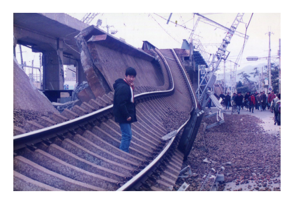
Figure 1. Damage of the 1995 Great Hanshin-Awaii Earthquake

international understanding, ICT, and health and welfare are examples of the content in integrated study periods. However, no specific mention is made in these materials of topics such as safety or disaster prevention. Nevertheless, it is clear that disaster prevention is not unrelated to the content listed in the examples.