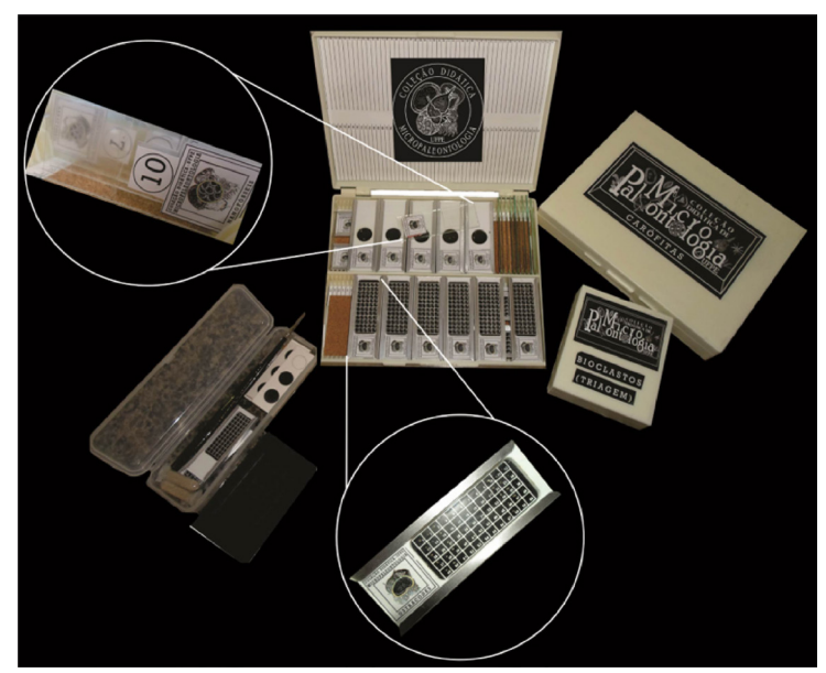
Figure 1. Setting and identification of kits in the didactic collection

For the study and identification of calcareous nannofossils and palynomorphs the slides have been divided into four quadrants, in order to facilitate the location and identification of the specimens.